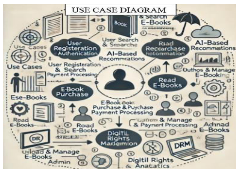
Figure 1 Use Case Diagram

Use Case Diagram: A use case diagram is a visual representation of how users interact with a system to accomplish specific tasks. It's a key tool in requirements gathering and software design, helping to clarify the system's functionality from the user's perspective.